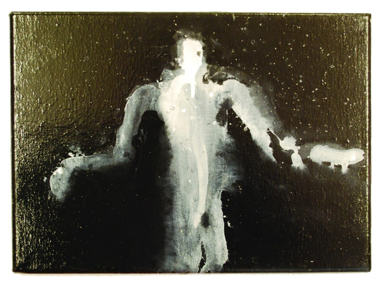
SUSIE HAMILTON ' Ecce Homo' from the Methodist Modern Art Collection, © TMCP, used with permission. www.methodist.org.uk/artcollection