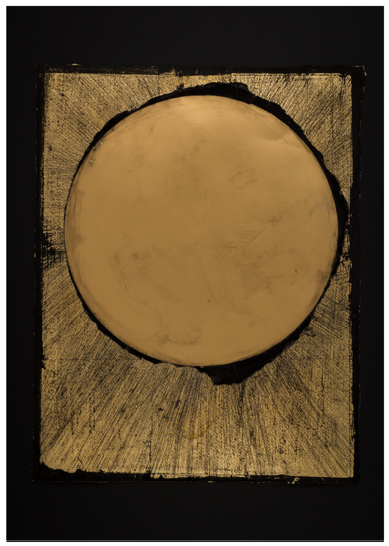
CAROLINE WATERLOW 'Sol Invictus/The Unconquered Son' <a href="http://www.carolinewaterlow.co.uk/">http://www.carolinewaterlow.co.uk/</a>