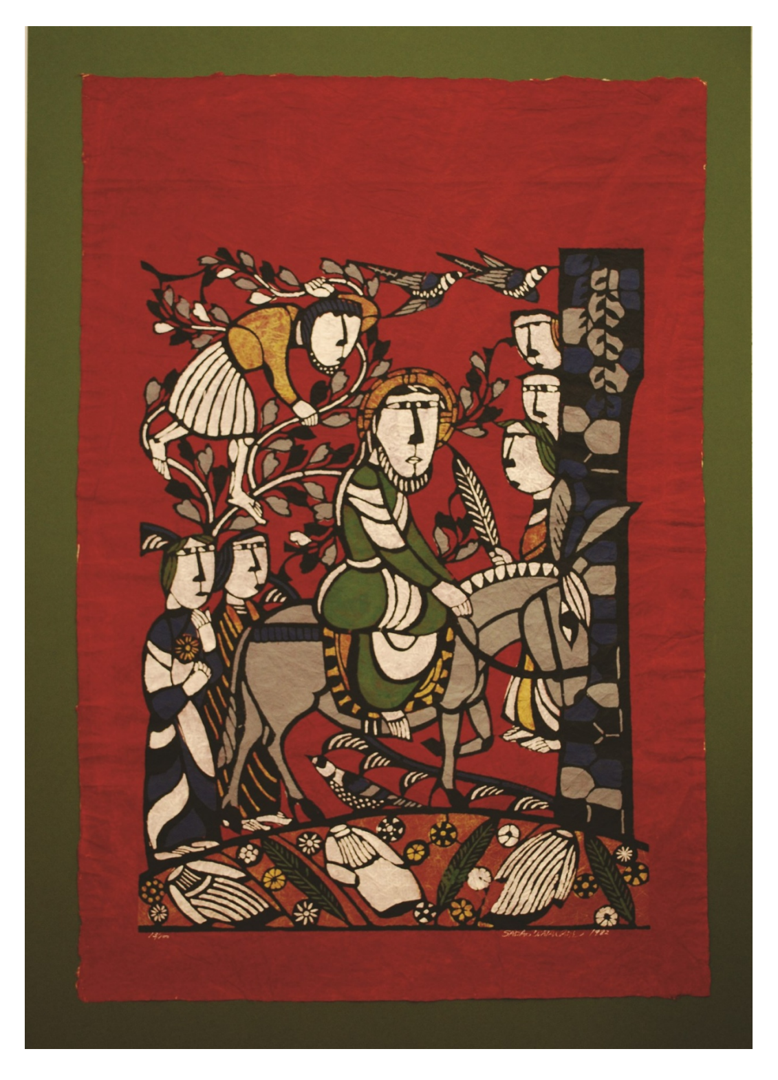
SADAO WATANABE ' Christ enters Jerusalem' from the Methodist Modern Art Collection, © TMCP, used with permission. www.methodist.org.uk/artcollection