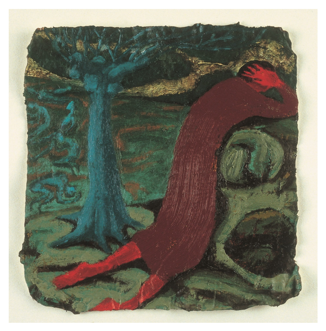
MARK CAZALET ' Fool of God (Christ in the Garden) ' from the Methodist Modern Art Collection, © TMCP, used with permission. www.methodist.org.uk/artcollection