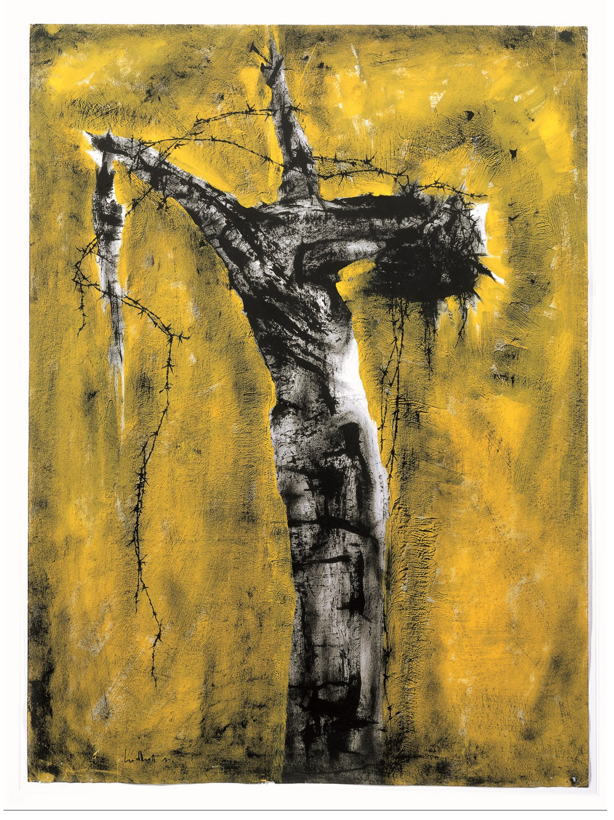
THEYRE LEE-ELLIOTT ' Crucified tree form - the Agony' from the Methodist Modern Art Collection, © TMCP, used with permission. www.methodist.org.uk/artcollection