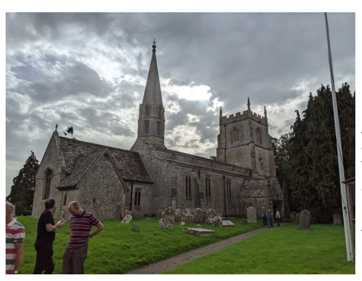
The two towers of Wanborough

All Saints, Liddington was our final tower of the day which has one tower with two rings of bells! We rang on the new ring of six, cast in 2016 and not the un-ringable ring of five that date back to 1663.