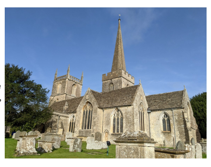
St Mary's, Purton, showing the two towers

Next was St Michael's, Highworth. An enjoyable ring of eight bells, then it was on to Shrivenham, with their fine ring of 10. After lunch we headed to St Andrew's, Wanborough; the second church of the day in possession of both a tower and a central spire. Before entry, female members of the band were requested to remove their pattens. We later discovered pattens are an early form of platform shoe!