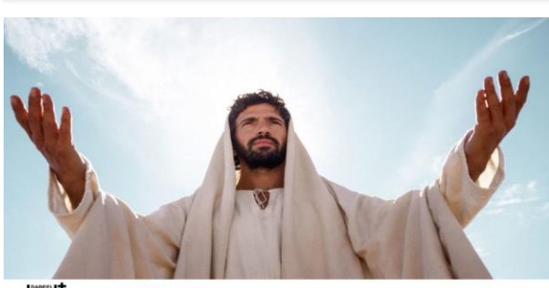
LORD hear our prayer