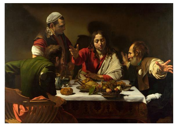
The Supper at Emmaus, by Caravaggio

Our online service for this Sunday, 26<sup>th</sup> April included the Gospel reading of the disciples' walk to Emmaus. The link for the service is <u>here</u>.